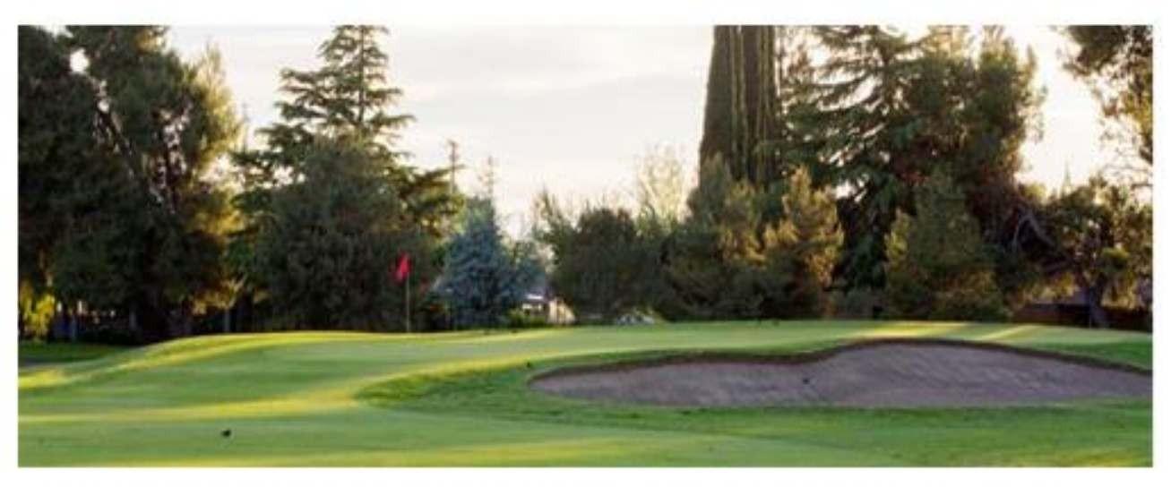
Stockton-Lodi SIR 2020 Combined Golf Schedule