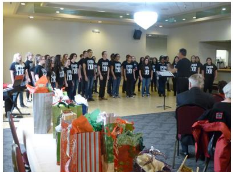
Gift Table and Lincoln High Choir