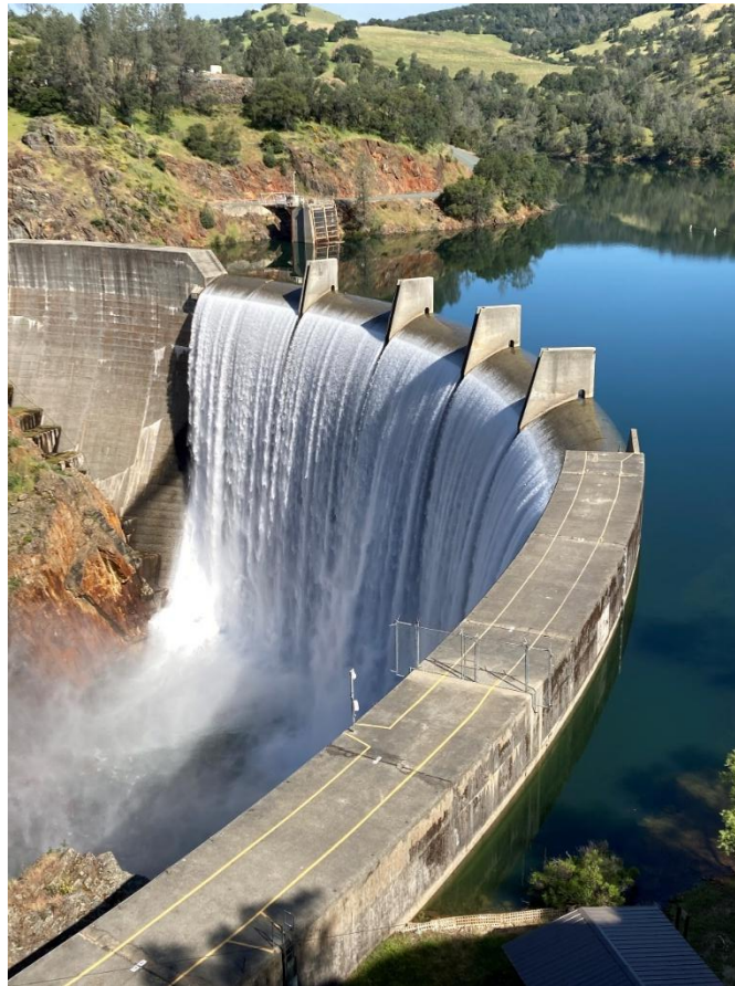
Taken a few years ago when the lake was flowing over the top

Englebright Dam Over the Top by club member Jim McLaughlin