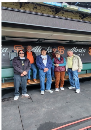
SIRs in the Giant’s Dugout May 11 th !

Bessie Carmichael @ Lapu Lapu 7750 Lapu Lapu St San Francisco, CA 94107