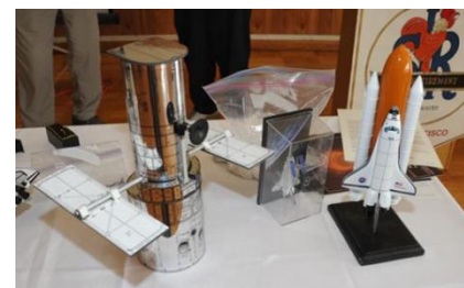
Models of Space Shuttle and Hubble Telescope