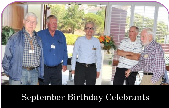
September Birthday Celebrants