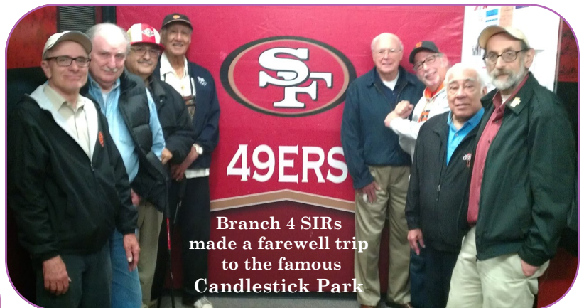
Branch 4 SIRs made a farewell trip to the famous Candlestick Park