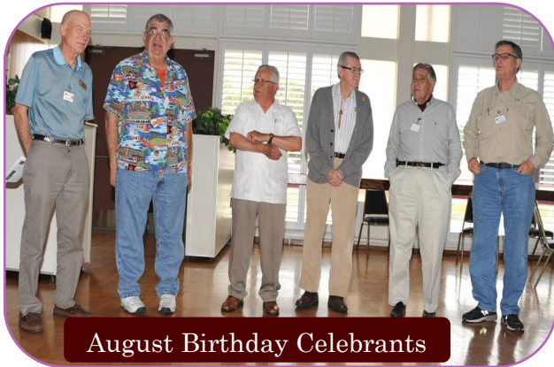
August Birthday Celebrants

Of course, I continue to encourage you to take advantage of travel offerings listed in SIR Happenings and offered by other Branches in Area 1. I bring flyers and remind you to check the Travel link on our website, http://branch4.sirinc2.org/ for details. If you do sign up for any of these tours, please send me an email or call me and let me know how it went: veatch-law@gmail.com . 415-297-1807.