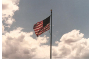
God Bless America