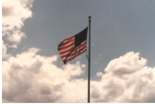
God Bless America