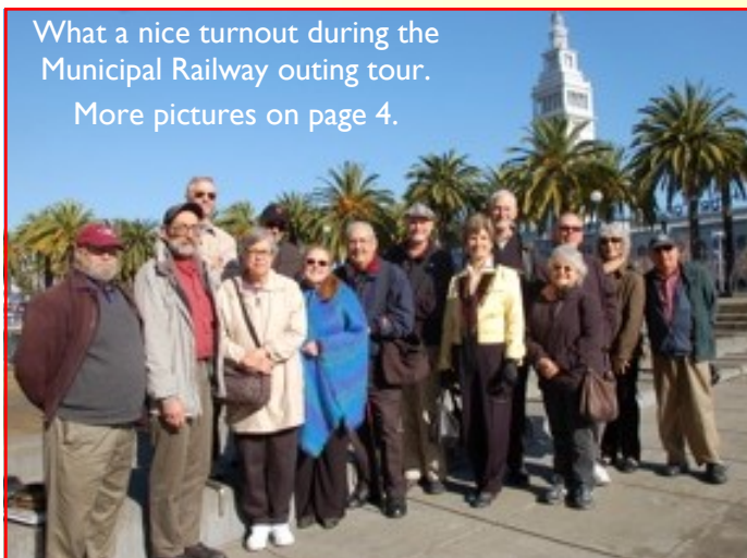
What a nice turnout during the Municipal Railway outing tour. More pictures on page 4.

Proceeds will be for the benefit of our Branch.