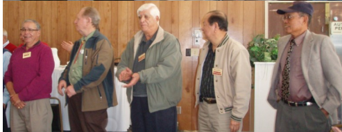
THE BIRTHDAY CELEBRANTS FOR THE MONTHS OF DECEMBER AND JANUARY.