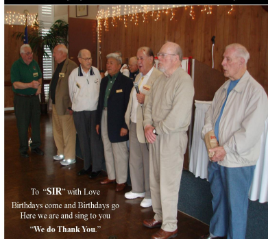
To "SIR" with Love Birthdays come and Birthdays go Here we are and sing to you "We do Thank You"