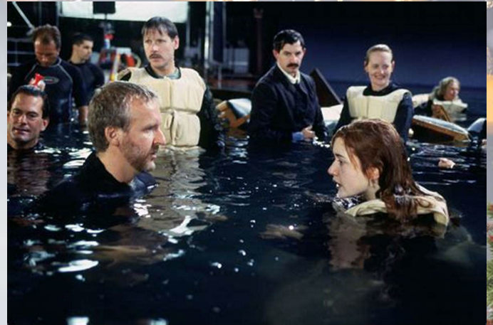
Cameron on-scene with Winslett, who '...suffered hypothermia and nearly drowned several times...'

James Cameron at the helm of this large vessel of a movie was a big plus, given his recent successes with "The Terminator", and "Aliens", but his lead actors were not proven box office draws, and his reputation for perfection drove many takes and retakes to the point where actors like Kate Winslet suffered hypothermia and nearly drowned several times. Was this backstory true? Well, here is a quote from Mr. Cameron himself responding to bad press rumors. "My manner on the set is intense, and I never give up until I know the scene is the best it can be. I ask people to rise to my level of commitment every single day."