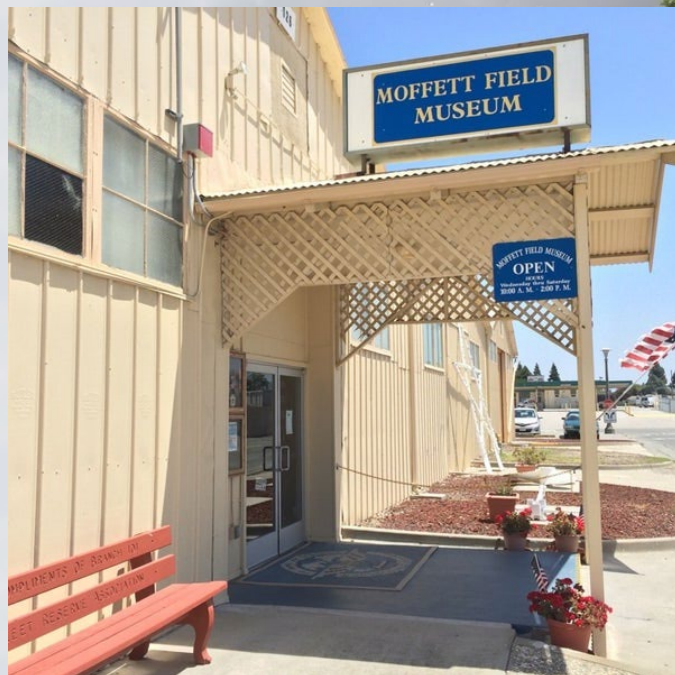
Moffett Field Museum Entrance