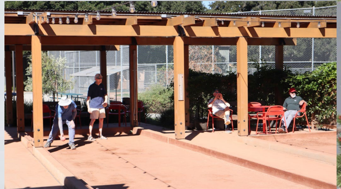
Some are shooting, some are shouting 'encouragement'!

The SIR Bocce Ball group meets and plays every Friday morning at the Los Altos Community Center Bocce Ball Courts (97 Hillview Ave, Los Altos, CA 94022).