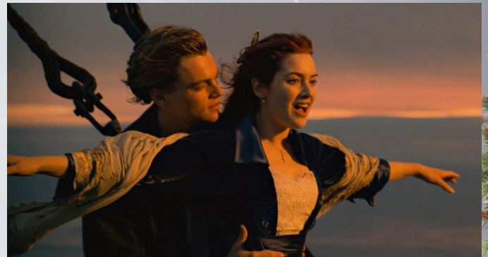
Winslett and DiCaprio learning to fly

The actresses considered to play Rose included Reese Witherspoon, Winona Ryder, Gwyneth Paltrow, and Claire Danes. It is reported that Claire Danes said she turned down the role because she knew the film would be successful and she wasn't ready for the amount of attention it would bring her. (Editor's note: Isn't acting all about attention, fame, and fortune? ) The actors considered for Jack included Matthew McConaughey and Johnny Depp. Depp was one of the most in-demand actors during this time and was offered the role but turned it down because the 180-page script was too long for him to get through. (Editor's note: Who said Hollywood actors are not pampered and privileged? ) By the way, Kate Winslett was 22 years old, and Leonardo DiCaprio was 20 years old when they starred in this film. (Editor's note: Youth ... sigh... )