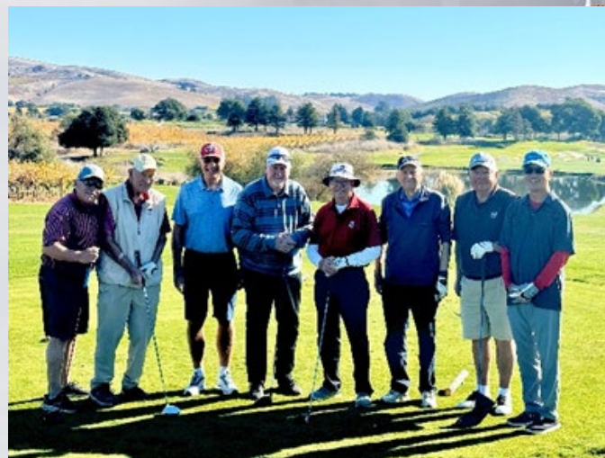
A group picture at the start of the round