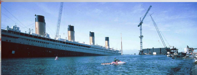
A large vessel: on-set for the sinking

Filming took from July 1996 to March 1997 (nine months). The on-site shoots, which are the most costly, had an original schedule of six months which compares to an industry standard of 60-90 days. The daily attendance of cast members, extras, wardrobe, make-up, production crew, catering, etc. had an average of 800-1000 people on location. No wonder expenses exceeded the budget soon after shooting started.