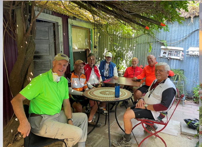
The biking group enjoyed lunch at The Nile Café

The SIR Branch 35 bike ride took place on November 14th on the Coyote Regional Hills/Alameda Creek Trail in Fremont, CA, a scenic, paved trail from Fremont to the downtown of Niles. Here's our last photo below taken at our favorite lunch spot, the Nile Cafe.