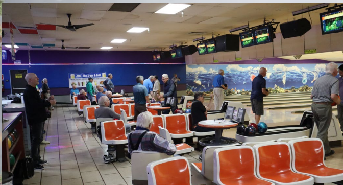
A happy bunch, rolling and chatting on a Tuesday afternoon!