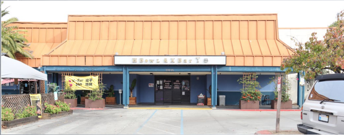
Homestead Bowl at Homestead Rd. & Hollenbeck Ave.