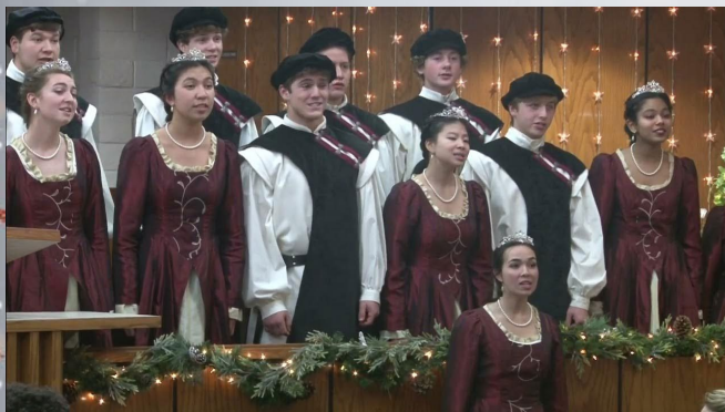
Mountain View High School Madrigals

It's time for our 2024 Holiday Celebration with your fellow SIR family. Our celebration party will be at the Mountain View Community Center, Redwood Hall on December 11th (2nd Wednesday). Doors open at 11:00am, with check in, table assignment, and some social time to mingle with your fellow members and friends. The buffet service will start at 11:40 am, and at 12:20pm we will be entertained by the MVHS Madrigal Singers. I'm sure they will put you in the holiday mood with their youth and splendid singing.