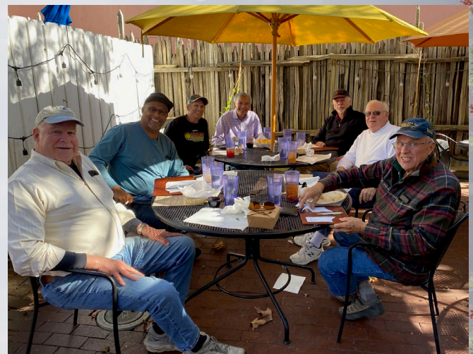
Mexican food on the patio at Jardine's Restaurant

German cars dominated with two Porsches and one BMW, a Lexus and a Corvette. The weather cooperated and was sunny and warm enough for tops to be lowered and the group enjoyed lunch on the back patio of the "Jardines" Mexican Restaurant.