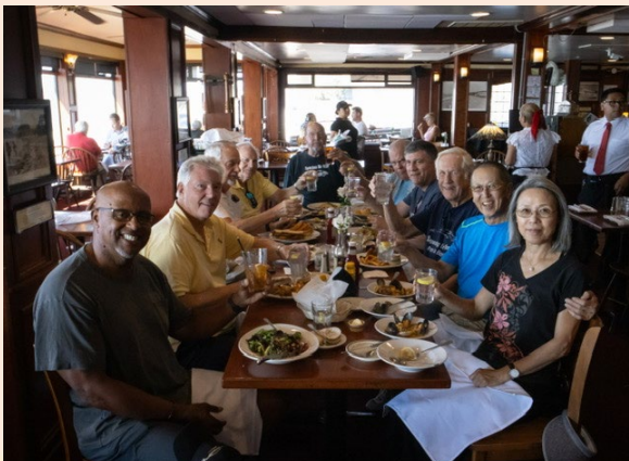
Lunch and banter among driving enthusiasts