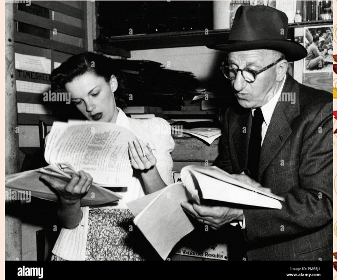
Judy Garland and Jimmy Durante prepare for Dick Treacy for a Command Performance, 1945

Jimmy was one of those 1930's self-made men, who dropped out of school in the eighth grade and started hustling for money. He played ragtime piano, taking jobs in bars, cabarets, and pleasure houses. He started singing in his act, adding comedy, and became a bandleader. He composed songs such as "Inka Dinka Doo", acted in many Broadway musicals and even played at the Palladium in London. Now a vaudeville star, he added his own radio and later television shows and was soon so popular as to be the headliner at posh night clubs, like Frank Sinatra.