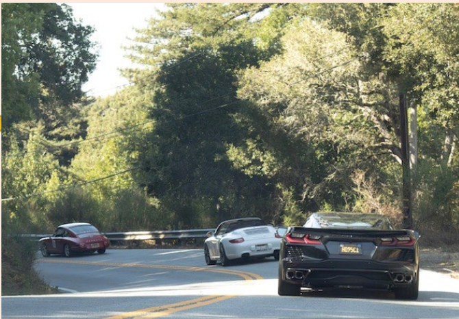
Swinging through the countryside is a joy for car and driver