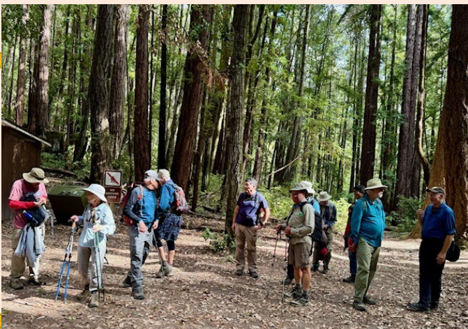
On Slate Creek Loop Trail

After the hike many of us retired to Alice's Restaurant for refreshments. We had a number of new people join us on the hike, so why not consider joining us yourself, on our future adventures.