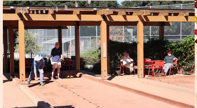
Some are shooting, some are shouting 'encouragement'!

The SIR Bocce Ball group meets and plays every Friday morning at the Los Altos Community Center Bocce Ball Courts. (97 Hillview Ave, Los Altos, CA 94022).