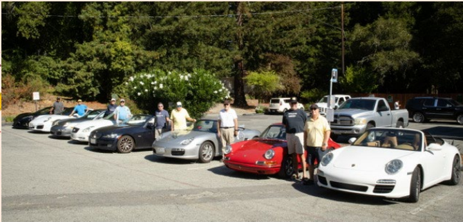
Proud and happy owners stand by their rides!

On October 2, 2024 the SIR Sports Car Group took a drive from the valley by way of Highway 84 and Pescadero Creek Road to get to our ultimate destination at the Miramar Beach Restaurant for lunch with 11 fun people. It was in the high 90's in the valley and we were in the mid 70's at the beach. It was an fun day.