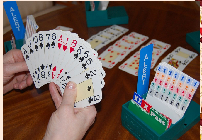
Quite a hand! Maybe a slam?

Our bridge club is meeting regularly for a friendly game of bridge on the 2nd and 4th Wednesday of the month at the Los Altos Senior Center from 12:00 till 2:00. If you'd like to join us, please do, just drop me an email or let me know and I'll add you to our mail list and you'll see the regular notices when we play. If you have questions, give me a call or an email.