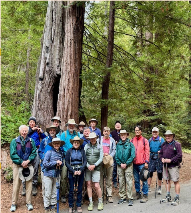
Seventeen Happy Hikers, plus one behind the camera!

Eighteen (18) enthusiastic hikers marched into Portola Redwoods State Park on the Slate Creek Loop Trail on Friday, 10/25/24. We hiked a little under 7 miles on a beautiful day in the woods and we took a side trip to the former location of Page Mill.