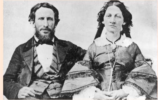
The Reeds, Donner Party Survivors