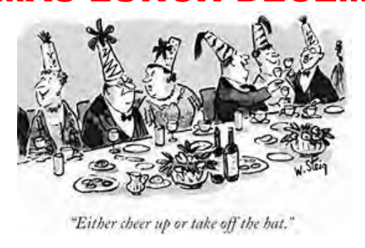
44 Members and Guests