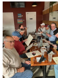
A good time was had by all!

NOTE- There will be NO Wine Club meeting in December, due to the Holidays. We will meet again in January.