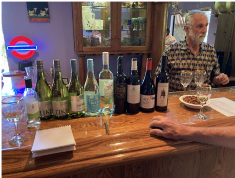
A sampling of Wines from “Down Under” at the October Wine Group gathering