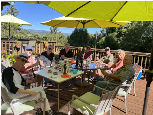
October Wine Group