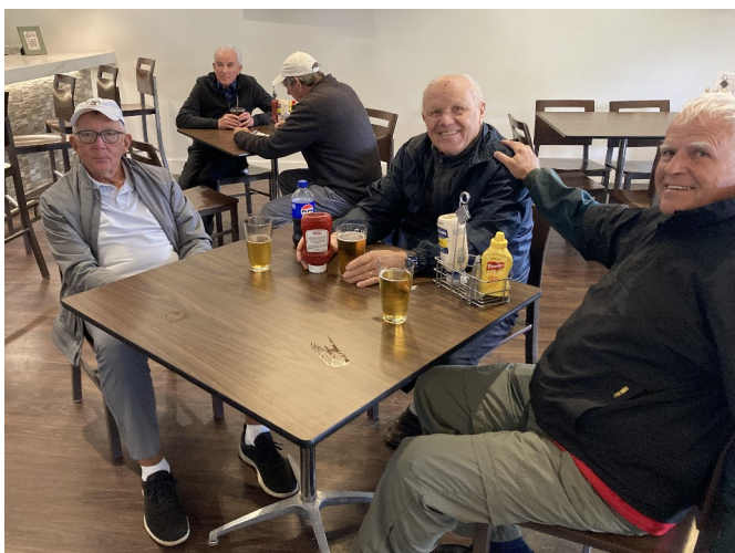
19th Hole at Laguna Seca