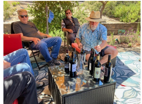
A sunny afternoon, good wine, good food, good friends