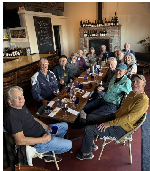
December 2025 Wine Group