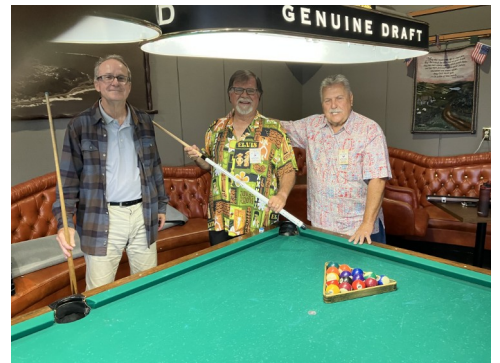
8 Ball Hustlers at the July Meeting

— Professor Harold Hill, "The Music Man"