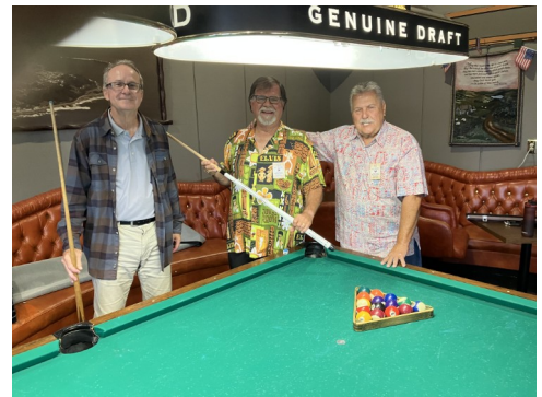
8 Ball Hustlers at the July Meeting

— Professor Harold Hill, "The Music Man"