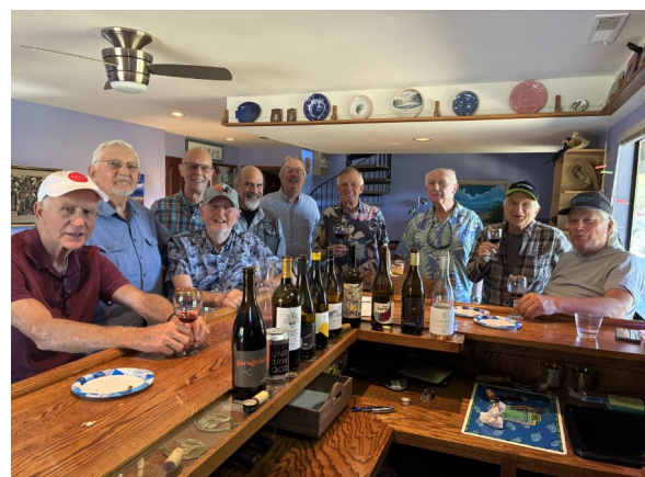
Wine Group, July 2025