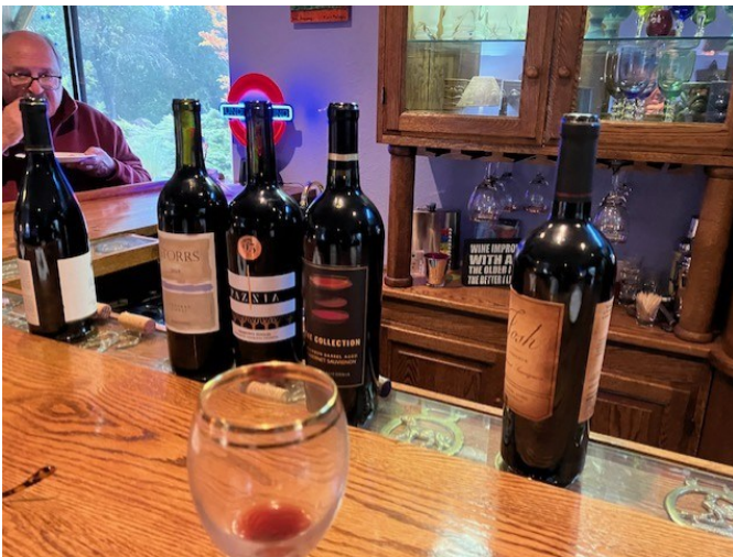
Good friends/good wine