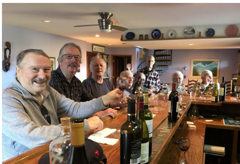
Wine Tasting -- see Page 3