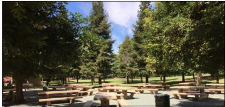
Picnic Site #1- Concord Community Park

Join Us for a Picnic in the Concord Community Park (Off Cowell) Thursday, September 19 th, 2019 11am to 4pm