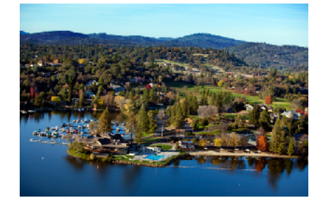
NEXT LUNCHEON JUNE 5 2019