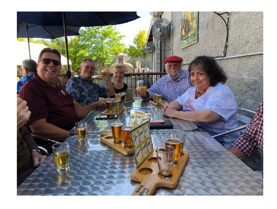
Loomis Basin Beer Tasting