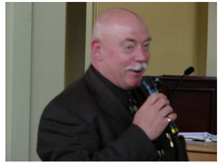
June luncheon guest speaker