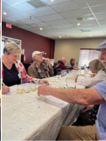
JANUARY Wine Tiplers