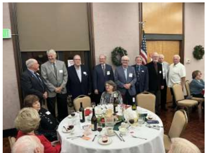
Our new and old Directors