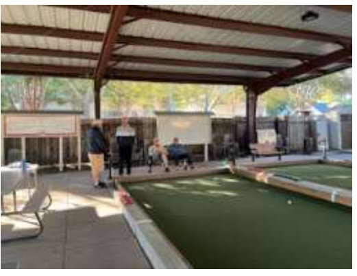
Sir 149 Bocce games every Thursday at Senior Center.