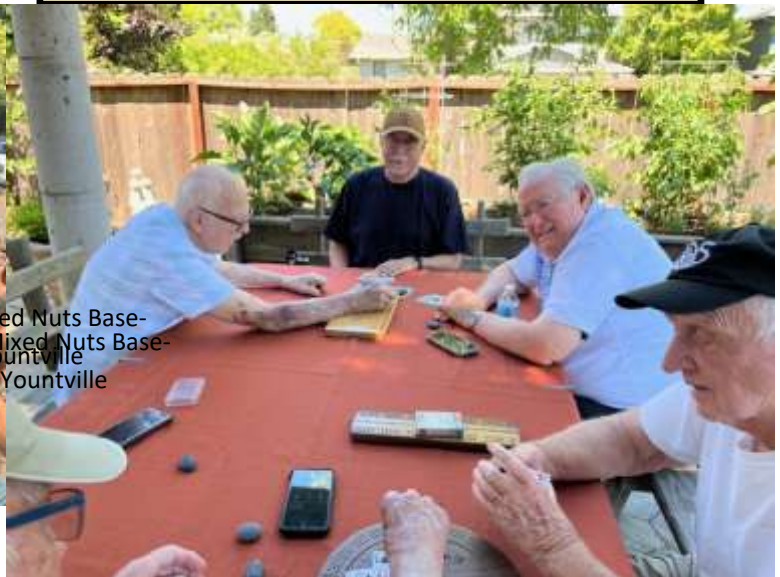
The Cribbage guys looking pretty chilled.