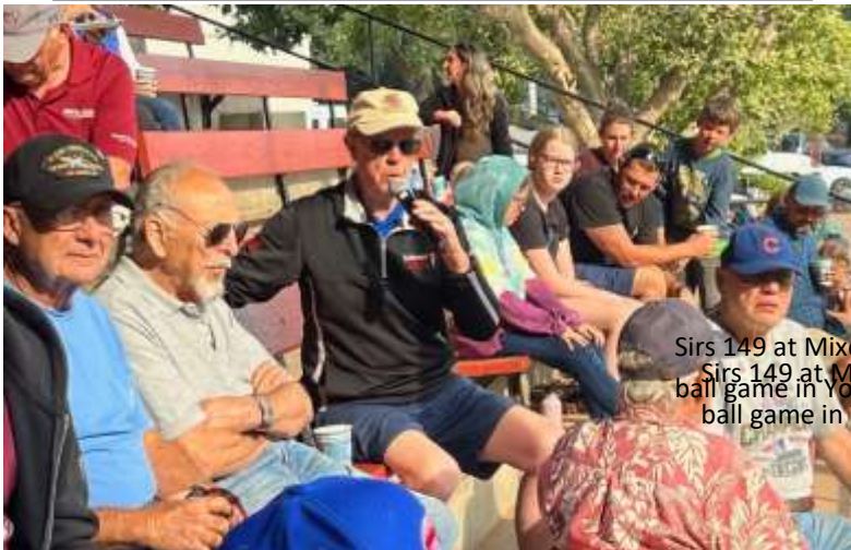
Sirs 149 at Mixed Nuts Baseball game in Yountville