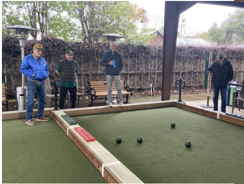
Thursday's Bocce at the Senior Center

Good time yesterday at armistice! Our next meeting will be on Tuesday 2/25 at 2pm and will be held at Fieldwork brewing, 1046 McKinstry street at the back of oxbow market near the river. See website below. They have a large outdoor area which is where we will gather. If the weather is bad I may pick a different site but for now plan on Fieldwork. This week is also Bay Area beer week so there may be a special beer event going on somewhere that we may want to attend. Final beer week schedules of events are not out yet but I will be watching and let you know if a change is warranted. You may want to check out events out also. The link to beer week events is below. https://fieldworkbrewing.com/napa/