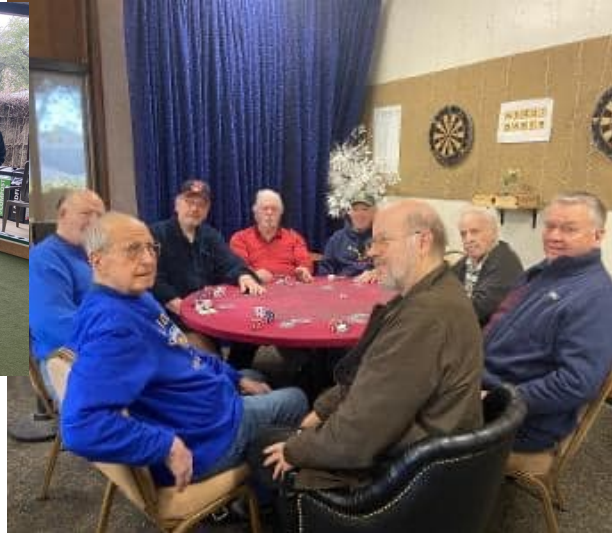
Monday's Poker at The Elks Club