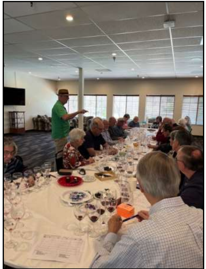
Wine tippers enjoying choclaate and cabs

Branch 149 was recognized for being among the highest branches with 41 new members in 2023.