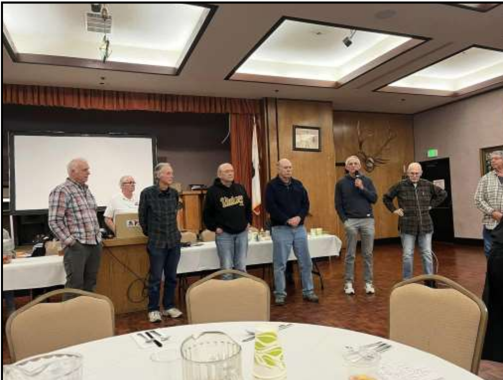
Our activity chairs