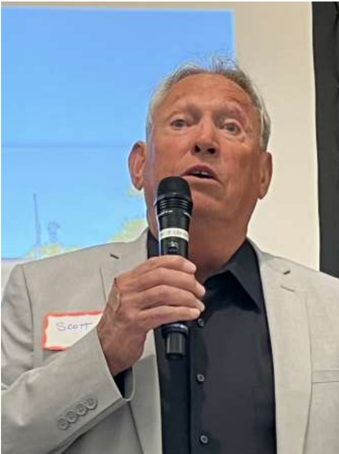
LAST MONTH'S SPEAKERS MAYOR SCOTT SEDGLEY DISCUSSING PROPOSED SALES TAX INCREASE