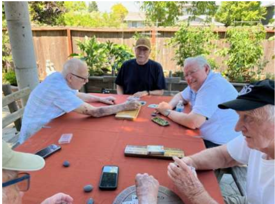
The Cribbage guys looking pretty chilled.