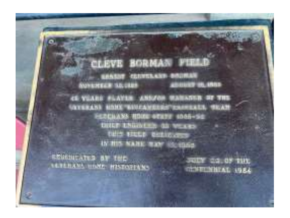
Where am I in the world?

Sirs watching a Mixed Nuts game at Borman Field Yountville