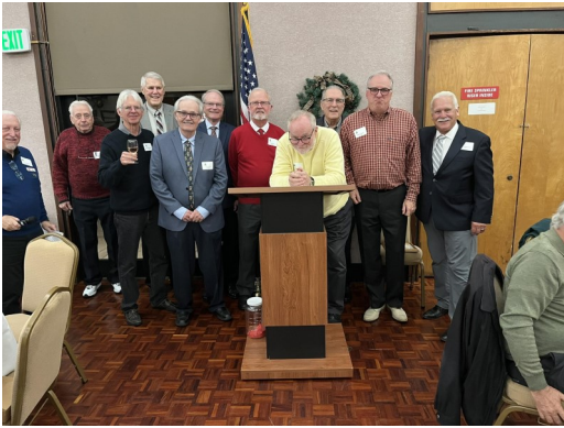
Your new board