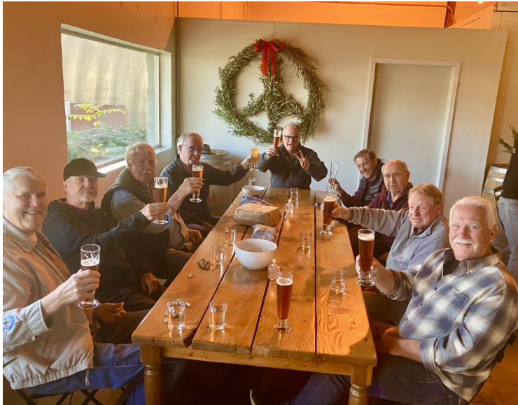
Artfully crafted brewski's were shared today 12/4, at St Claire Brown brewery in Napa. The honey wheat and red ale were very satisfying and all enjoyed the great holiday cheer!