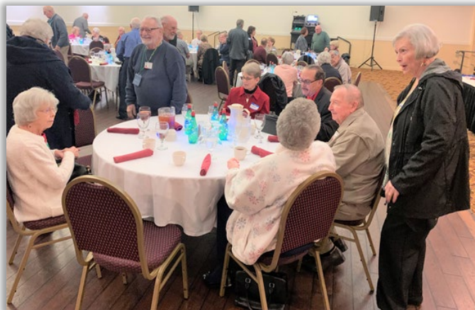
Enjoying each other's company & conversation. (more pictures page 2 under Minutes)