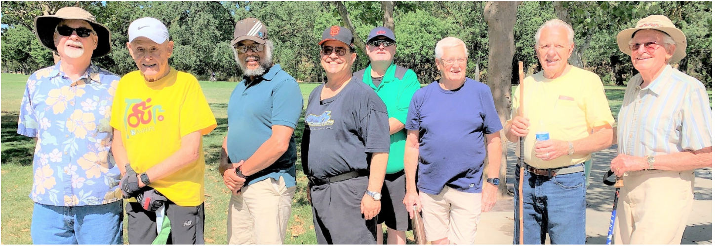
Branch 144 Walking Group on June 6, 2020 (our first walk)

DUES WILL BE WAIVED UNTIL FURTHER NOTICE FOR 2021