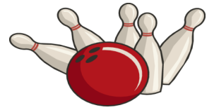
Thursday's champions team #3 "Splintered Wood"

Charles Waller (415) 269-4950 chupeg@icloud.com