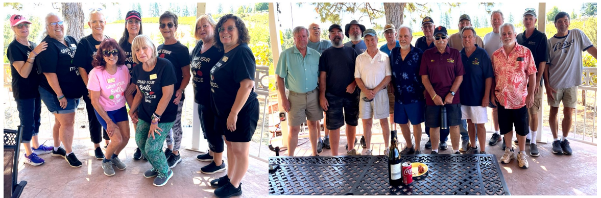
Emblems Ladies Club