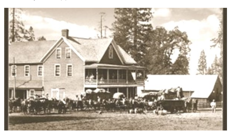
Originally it was a hotel, restaurant, and a stage stop that could accommodate 500 horses, with extensive corrals. It is 12 miles to the east of Placerville and was also known as 12 Mile House.

Lumber interests hauled logs on the road, and through the years the road was steadily worked on to make it an all weather route. Sportsman's Hall was a major stop for anyone traveling through this part of the Sierra. Any freight wagon going over Echo Summit passed in front Sportsman's, and they all stopped here.