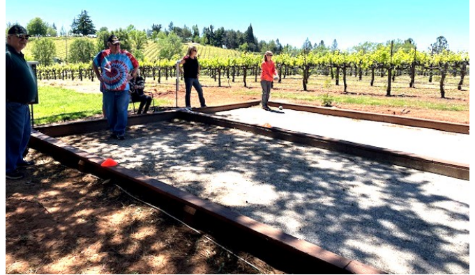
First bocce ball competition. Lots of fun with snacks brought by the attendees and wine from the winery.

On June 6-7th we'll be close to home as we bowl our first SIR tournament at The Apex at Red Hawk Casino. The Apex has become a premier non-smoking family fun center, with a sports bar, virtual games, four golf bays, three floors of car racing and 18 lanes of bowling. If you have not been to Red Hawk Casino, the SIR tournament will be a great time to stop in, look around, and say hi to some SIR friends. We'll be there 10:00am to 4:00pm each day. Later in June SIR Branch 59 will host their tournament at Earl Anthony's Dublin Bowl. For more information about SIR bowling, the full calendar, and applications, check out our website at: http://www.sirinc3.org/sirBowling/index.html