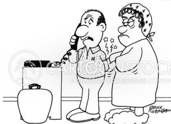
"Count me out for bowling tonight...my arm kinda hurts."