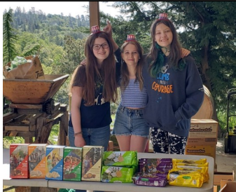
Girl Scout Cookies'