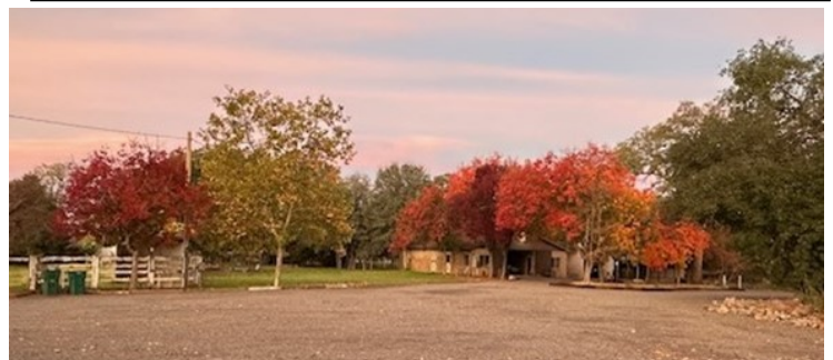
A view of the fall colors from my front door.

On behalf of the BEC, I would like to wish everyone a Merry Christmas and a healthy New Year.