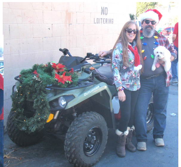
TWO PEASES IN A QUAD