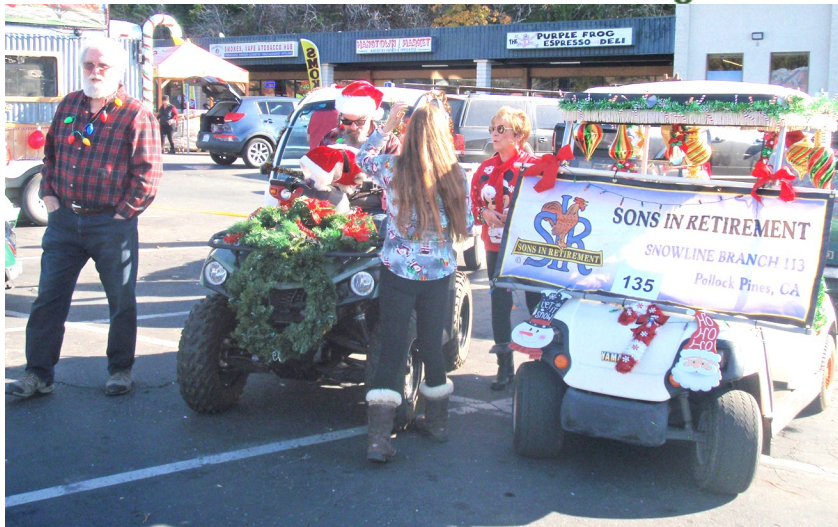
SIR BRANCH 113 READY TO ROLL! 2021

The 2022 Hangtown Christmas Parade A Charles Dickens Christmas is accepting applications for the Sunday, Dec. 4, parade. The parade takes place on Broadway and Main Street in Placerville starting at 1 p.m. Check in for participants is 11 a.m. Entry fee is an unwrapped gift for Toys for Tots