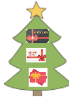
NEW THIS YEAR "GIFT CARD TREE"