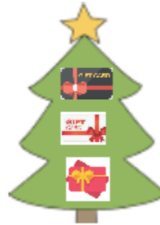
NEW THIS YEAR "GIFT CARD TREE"