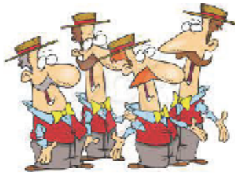
COUNTRY CLUB AIRES CHORUS & BAND