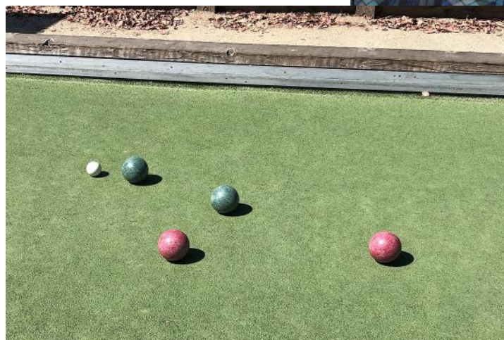
Green is looking good.